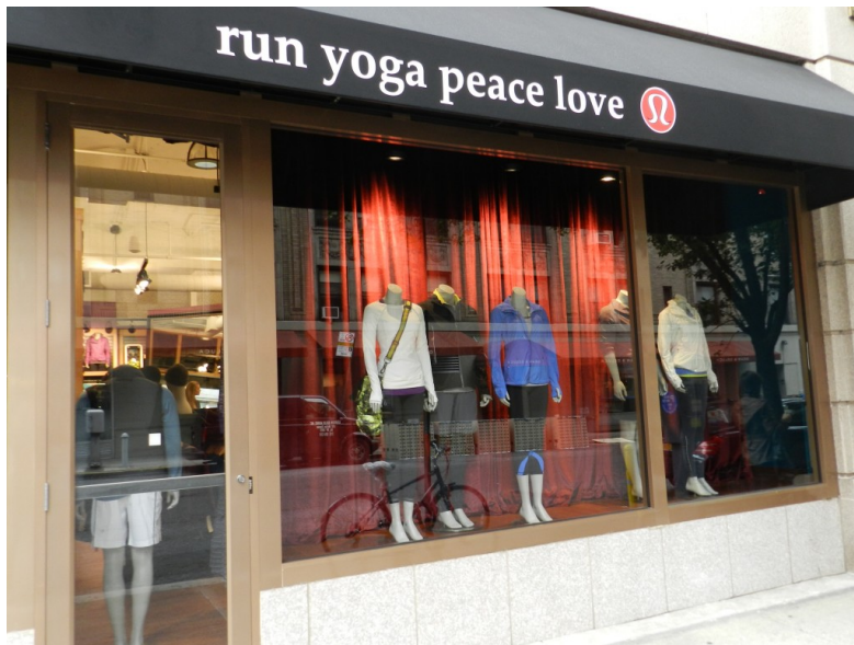
The new Lululemon Madison Avenue store at 85th Street

Last Friday, Lululemon opened its newest store on Madison Avenue at 85th Street. It's the powerhouse fitness-fashion brand's sixth location in New York City—and second one on