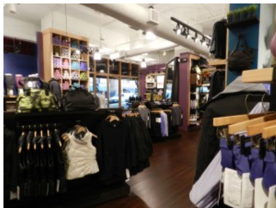
There's a bit more elbow room between the racks

One slight upgrade: The L-shaped layout, high ceilings, and generous elbow room between the racks, which give it the luxury of space. (Could it be that not all the stock has arrived, though? Time will tell.)