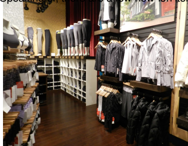
Signature display of yoga pants

Speaking of, there are a few new-ish items we spotted that we want to go back for. These